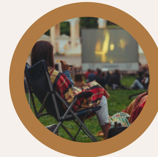
Movies In The Parks