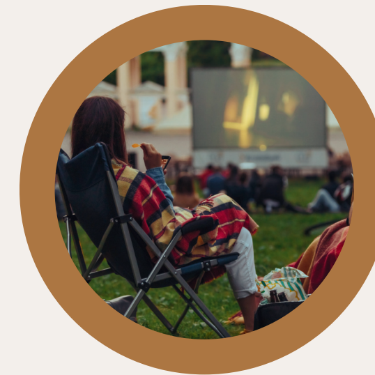
Movies In The Parks