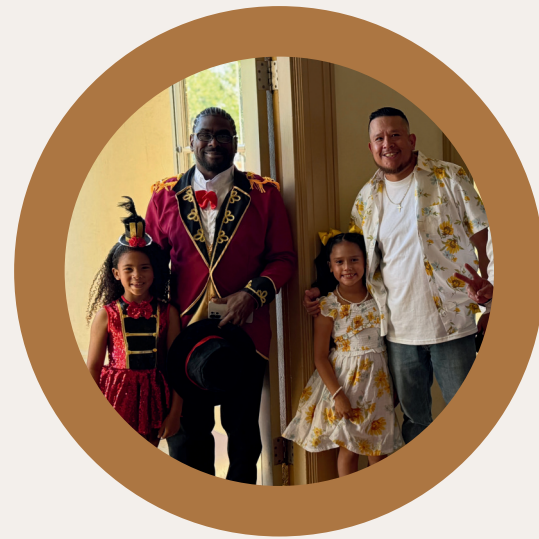
Father & Daughter / Mother & Son Dances