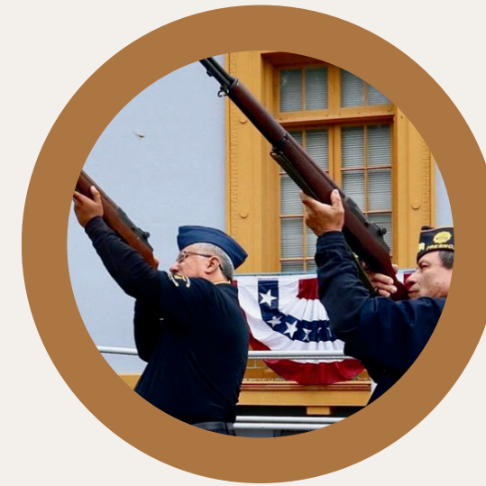
Echoes of Courage